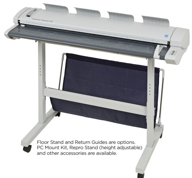
Floor Stand and Return Guides are options. PC Mount Kit, Repro Stand (height adjustable) and other accessories are available.