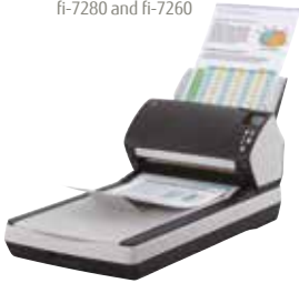
fi-7280 and fi-7260

fi-7160 / fi-7260 – A4 Portrait at 300 dpi 60 ppm / 120 ipm fi-7180 / fi-7280 – A4 Portrait at 300 dpi 80 ppm / 160 ipm Scan mixed batches through the 80 sheet ADF