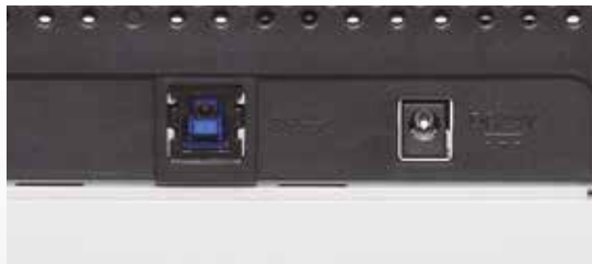
High speed performance through USB 3.0 interface

All four scanner models additionally make use of an ultrasonic sensor that accurately detects multifeed errors where two or more sheets are fed through the scanner at once plus the Intelligent Multifeed Function allows document scan parameters to be applied which enables the sensors to be set up to help identify and subsequently ignore attachments such as sticky notes or items with a photo attached that would otherwise cause disruptions to the scanning process.