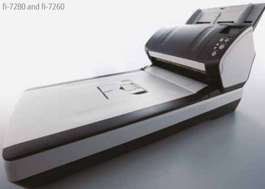
fi-7280 and fi-7260

Carrier sheets allow you to scan documents, larger than A4 or photos and clippings that are at risk of being damaged when processed through an ADF. {Part Number – PA03360-0013}