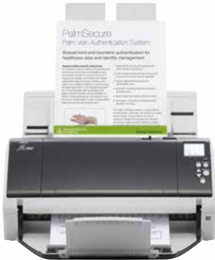
fi-7460 – A4 Portrait at 200/300 dpi 50 ppm / 100 ipm fi-7480 – A4 Portrait at 200/300 dpi 65 ppm / 130 ipm Scan mixed batches; place up to 100 sheets at a time; add sheets while scanning.

High speed performance through USB 3.0 interface, ideal for large format image capture and PaperStream powered multi-streaming, creating up to three separate images of each document simultaneously without delays.