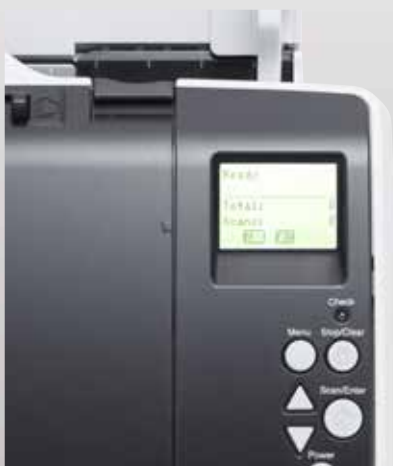
Integrated backlit enhanced LCD operating panel

A backlight enhanced LCD screen within the operating panel puts instant information at your fingertips, including scanner settings, operating status, interaction hints and a paper counter. Also, selecting from the user panel pre-defined scanning routines created with the powerful PaperStream Capture solution included in the package, is a breeze.