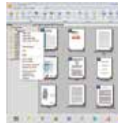
The PaperPort SE14 main screen

-The Professional Choice to Organize and Share Your Documents