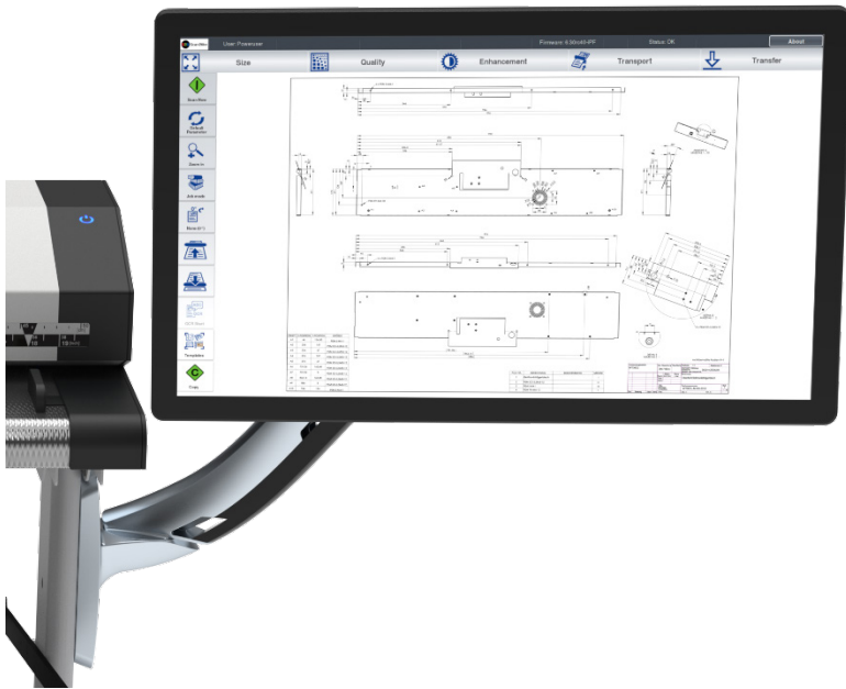
Full HD monitor with adjustable monitor arm mounted to the side of a WT36/48/60-STAND