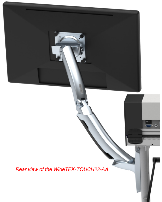
Rear view of the WideTEK-TOUCH22-AA