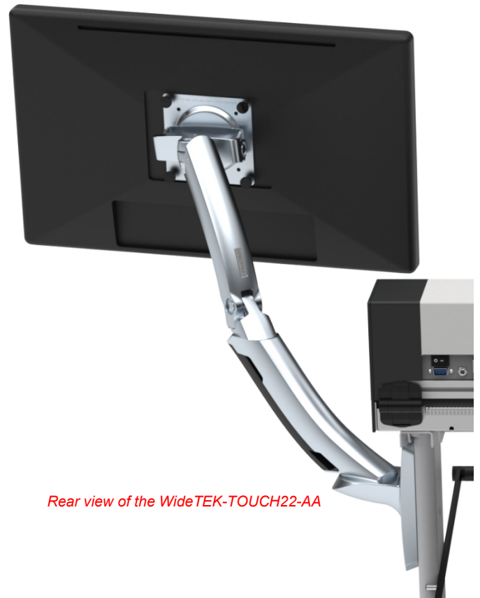
Rear view of the WideTEK-TOUCH22-AA