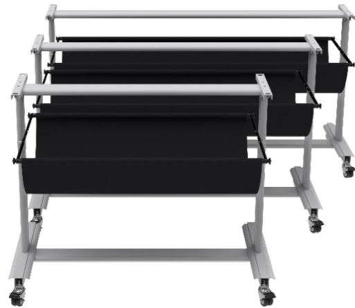
Three stands for all WideTEK sheetfeed scanners.