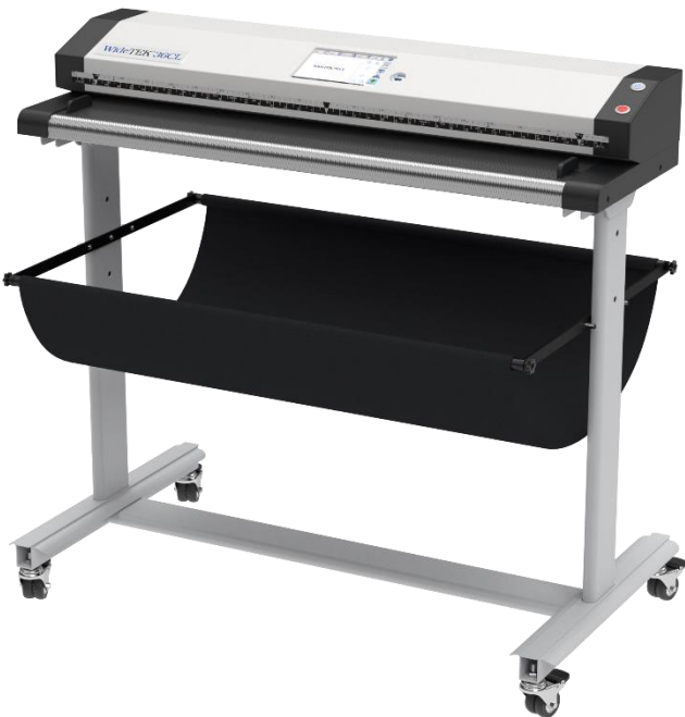
WT36 Stand with paper catch

The paper catch can be mounted at three different heights, without a tool. In addition, the catch can be mounted off center, to allow a greater input area in the back or in the front.