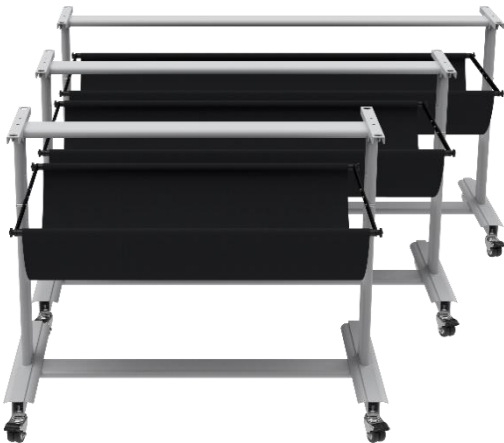
Three stands for all WideTEK sheetfeed scanners.