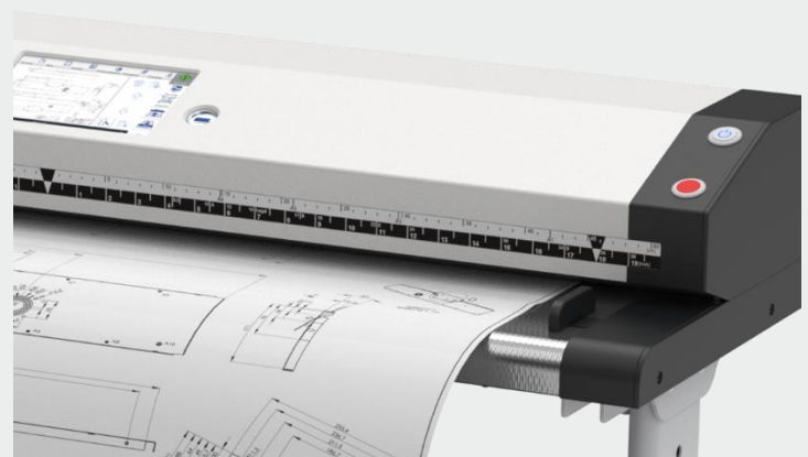
A USB 3.0 port let you take away your scanned images on a USB device.

WideTEK® 36CL-600, a valuable production device for numerous markets