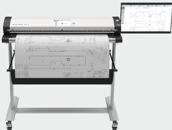
Large documents like maps rewind to the front or fall into the paper catch.

The WideTEK® 36CL produces extraordinarily sharp images, with color accuracy even superior to competing CCD scanners. Document rotation is done on the fly, a scan of an E-sized / A0 document in portrait mode at 300 dpi in 24bit color takes less than 7 seconds to scan and another 2 seconds to crop & deskew, preview and store.