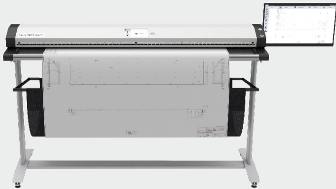
Large documents like maps rewind to the front or fall into the paper catch.

The WideTEK® 60CL produces extraordinarily sharp images, with color accuracy even superior to competing CCD scanners. Document rotation is done on the fly, a scan of an E-sized / A0 document in landscape at 300 dpi in 24bit color takes less than 7 seconds to scan and another 2 seconds to crop & deskew, preview and store.